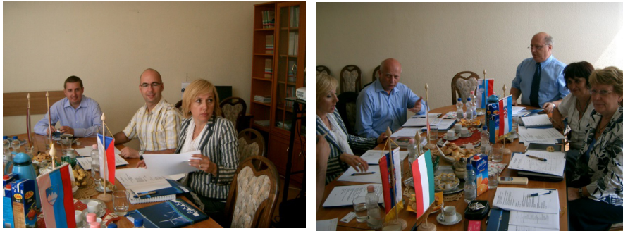
Figure 2: Sign the contract about the collaboration in Budapest