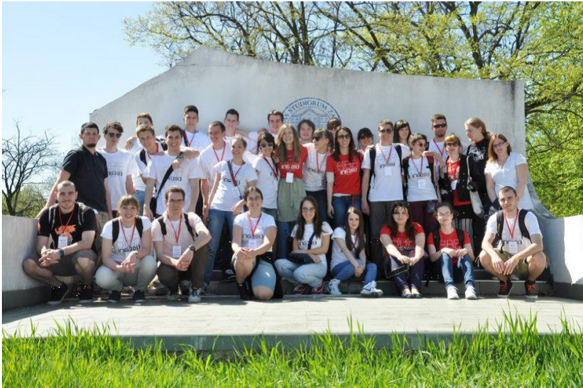
Figure 3: The participants of the ING'2013 competition

During the years workshops were organized, such as “Calligraphy”, “3D printing”, “Make your own pop-up book” and “Design innovative packaging”. Also, guest lectures by renowned designers were held, and they presented some of their most successful works. The opening ceremony of ING takes place in the Conference Hall of the Faculty, followed by the introductory briefing and presentation of the assignments.