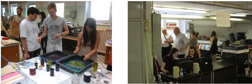
Figure 7: The process of creation in the paper and print laboratory.

At the closing event, the students and teachers could bid farewell to each other during a genuine Hungarian garden party on the hill side behind the building of the Faculty (Figure 8).