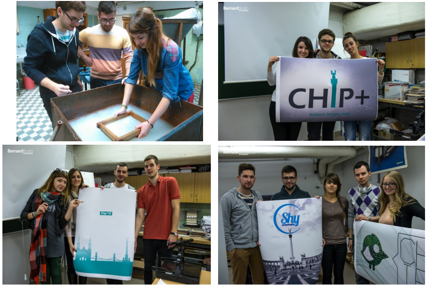
Figure 5: Activities at the workshops

Five Croatian and five Serbian students arrived at the program staged from 8 until 13 November, while for that week the faculty students’ hostel provided accommodation to the guests. They were joined by the Hungarian team that would travel to the ING competition the following year. They were also acting as the hosts of the event with the support of the teachers of the institute. The very intensive 5-day program kicked off with an “open air” workshop on Sunday.