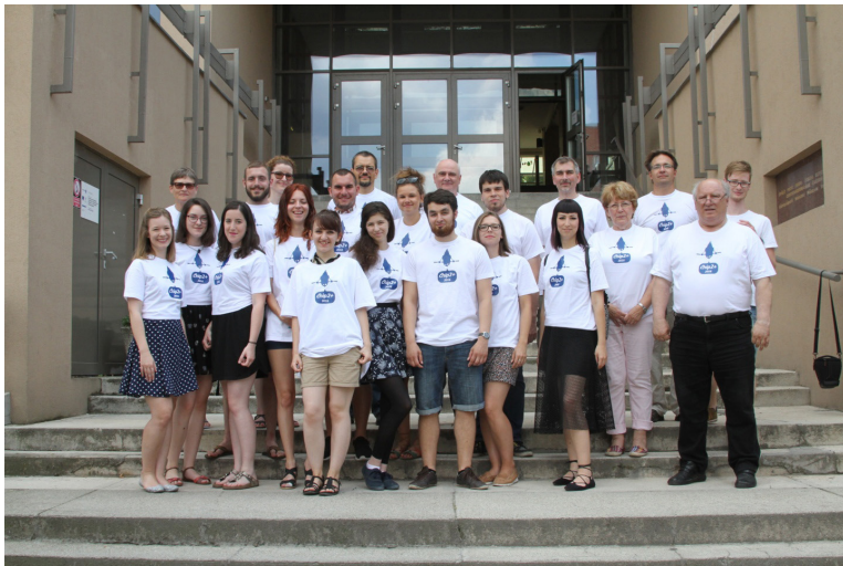
Figure 8: The participants of CHIP2+