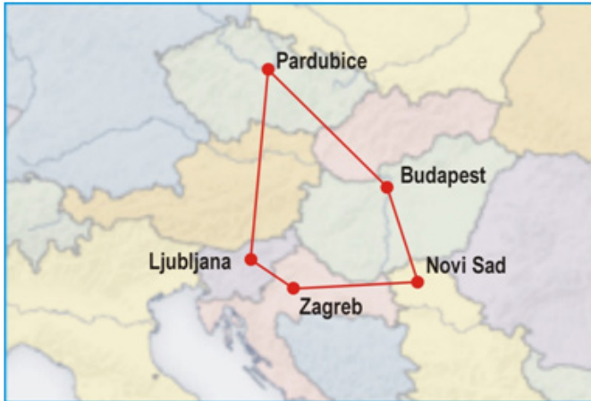
Collaboration of 5 universities in the higher education of graphic arts

Five Central European universities, the University of Ljubljana (Slovenia), University of Novi Sad (Serbia), Óbuda University (Hungary), University of Pardubice (Czech Republic) and University of Zagreb (Croatia) have been working in collaboration for years now in the education and research of graphic communication. In addition to aligning their activities with each other, they aspire to shape and adopt novel forms of joint work (see Figure 1).